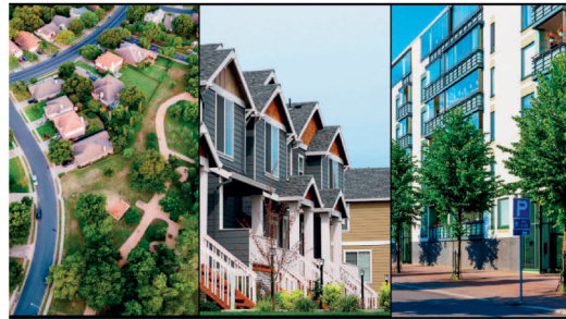
Realestate Digital Marketing

Digital Marketing Services for Politicians in India