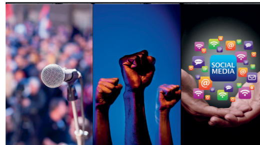
Political Digital Marketing