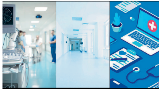
Hospitals Digital Marketing